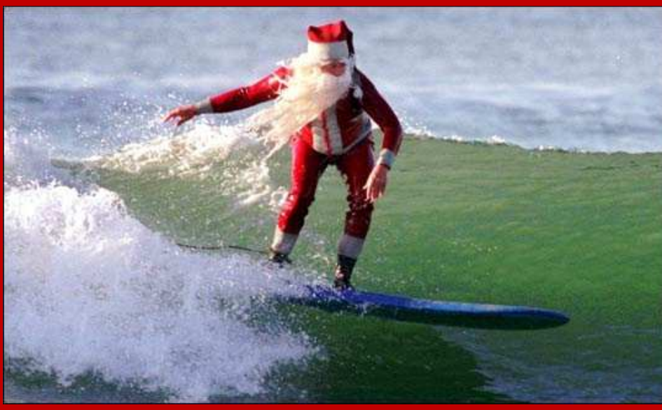
After a long night of delivering presents, Santa spends Christmas Day catching waves and a tan at Sydney's famous Bondi Beach.

We would like to extend our Warmest Holiday Wishes and a Happy New Year to you and your family!